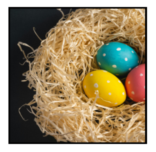
Happy Easter! HE IS RISEN!